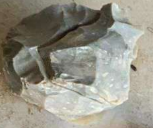
Nucleo de cui sono state metodo "Levallois" Core with flakes removed by the method